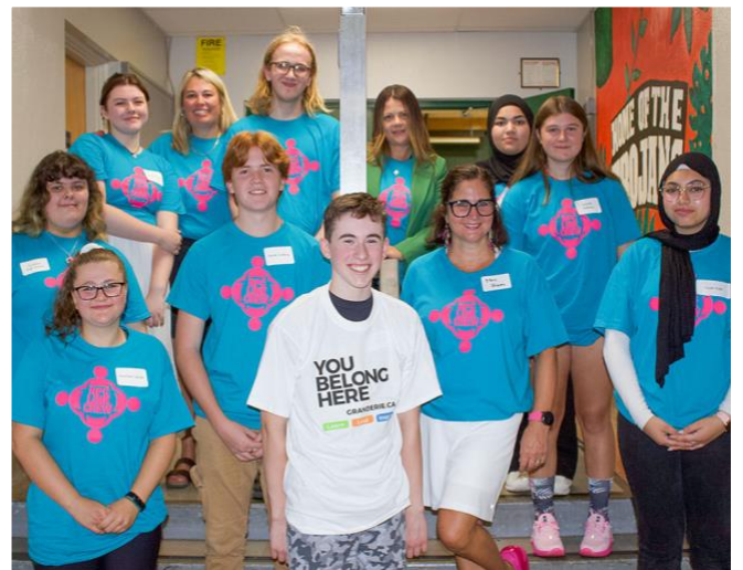
Above: North Park Collegiate and Vocational School's Link Crew show off their school spirit.