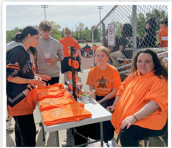
Above: PDHS Students at the annual Every Child Matters football game.

September 30 was the National Day for Truth and Reconciliation, with schools across Grand Erie recognizing its importance in a variety of ways. In addition to the curriculum-focused learning, there were several special events. To cap off Truth and Reconciliation Week, Pauline Johnson Collegiate and Vocational School hosted its annual Every Child Matters football game, once again providing a learning spotlight for the school community to honour and recommit to ongoing efforts building understanding while raising funds for community initiatives. As part of a separate event, the school also hosted three residential school survivors, joined by five PJ students, in a circle discussion in the learning commons, streamed across the country through the National Centre for Truth and Reconciliation in partnership with Grand Erie and the Survivors' Secretariat. Over in Norfolk County, Teeterville Public School took part in ReconciliAction, creating a medicine wheel and adding words and drawings reflecting on what school experiences should be like for children.